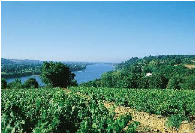
Vineyards with a view of the Loire River

It is the soil that now makes the Loire valley famous. In this region of France the soils are so full of limestone, tufa, chalk and what the French call "silex," that it produces some of the most unique and unrivalled wines in the world. This is the same soil that for centuries has been dug out of cliff sides to create thousands of kilometers of caves. Amongst the caves are stories of hidden passages that saved paintings, treasures and lives during the occupation in WWII. Those same passages now perfectly age sparkling and still wines, ensure a constant