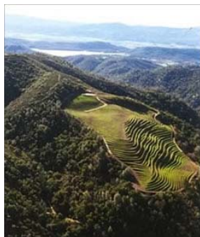
Green & Red Vineyards

It isn't just that I found a Zinfandel I can tolerate, I've found one I really like. I had only tasted Green & Red Zin once a year ago, and was then pleased that it wasn't over-the-top jammy. The other day, when checking for corkage, I tasted this wine again and in just a small sip was overwhelmed by its delicious dark berry flavor and chocolate elegance. I had to have a bottle, and I had to share it with the wine club. The texture has a pleasant subtle grittiness that demands the attention of your palate while still maintaining a rich and silky sensation. I know that's a contradiction, but this wine pulls off both textures and has a lengthy finish to boot.