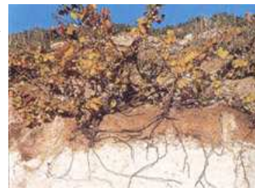
Vines chalk-rich soil of Cramant

Grand Cru vineyard selections aged a minimum of 4 years ( 1 in old barrels, 3 in bottle) before